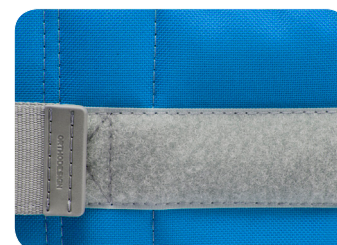
Blue Size 1a, 2