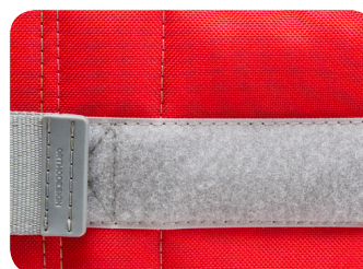
Red Size 2a, 3