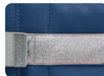
Blue Horizon Size 3a, 4