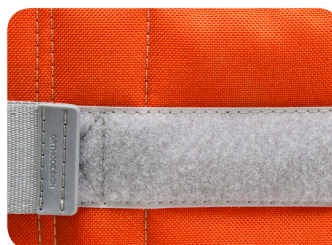
Orange Size 0a,1